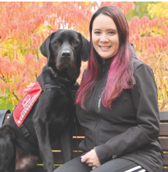
Jaz, the newest Facility Support Dog Guide

Facility Support Dogs Marielle and Jaz help professional agencies assist people in traumatic situations. These dogs are trained to provide on-scene support when requested to those most vulnerable in the community.